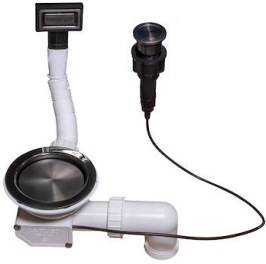
Space Push Gun Metal automatic waste fitting - PO