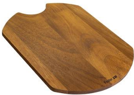
Iroko-wood chopping board 8648 002